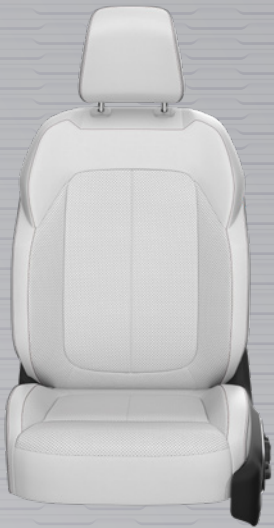
Neo Ultra Lux II with Axis II Perforations, Wine Accent Stitching and Crescent Piping — Global Black/Arctic (Available)