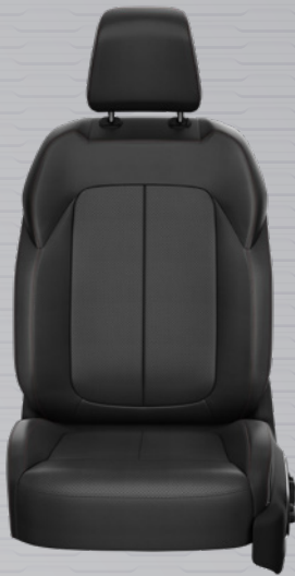
Neo Ultra Lux II with Axis II Perforations, Wine Accent Stitching and Crescent Piping — Global Black (Standard)