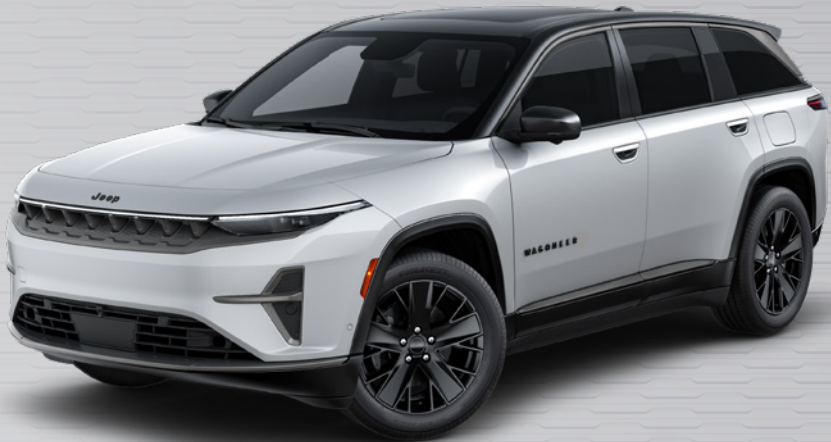
Launch Edition in Silver Zynith