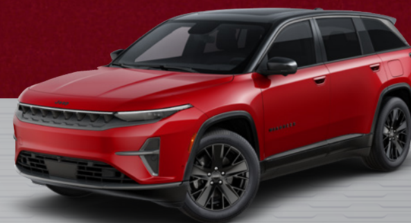
Red Hot Pearl