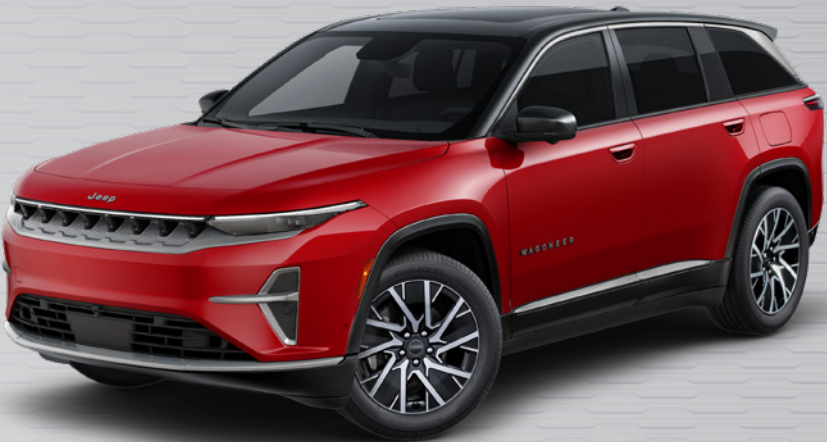
Limited in Red Hot Pearl