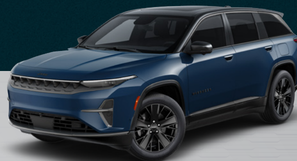
Fathom Blue Pearl