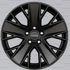
20-inch Gloss Black-Painted Aluminum (Standard with Obsidian Package)