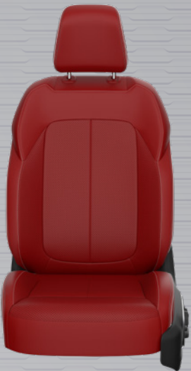
Neo Ultra Lux III with Axis II Perforations, Blue Agave/Light Slate Gray Dual Accent Stitching and Frost Piping — Black/Radar Red (Available)