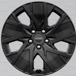
20-inch Painted Aluminum (Standard)