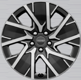
20-inch Painted Diamond-Cut Aluminum (Standard)