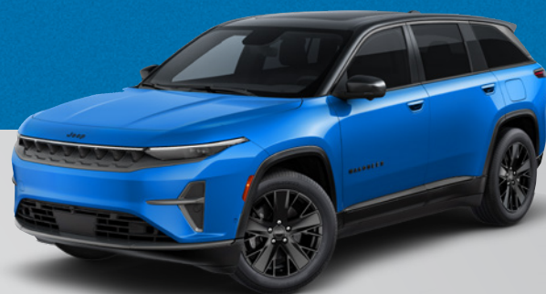
Hydro Blue Pearl